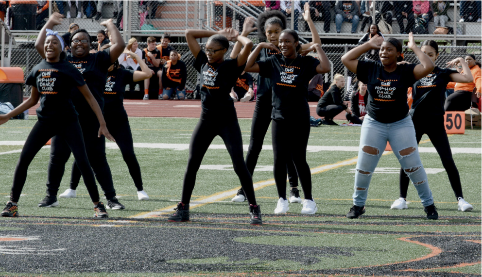
DeKalb Hip Hop Club performing during the powderpuff halftime show!