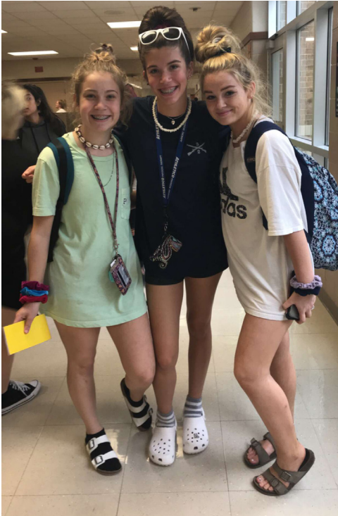
Underclassmen girls dressed as "vSCO" girls.