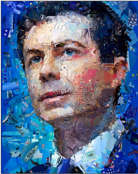
Pete Buttigieg depicted in an artistic form

Elizabeth Warren is one of the front runners in this election. Prior to politics, she was a school teacher, law professor, and a lawyer. She was once a registered Republican but left