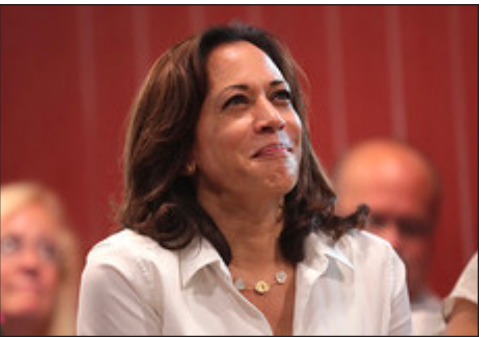
Kamala Harris beaming with a smile from ear to ear

A 53 year old politician, Steve Bullock plans to win over Trump sup-