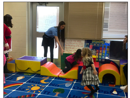
Students play with the preschoolers involved in Alphabitty.