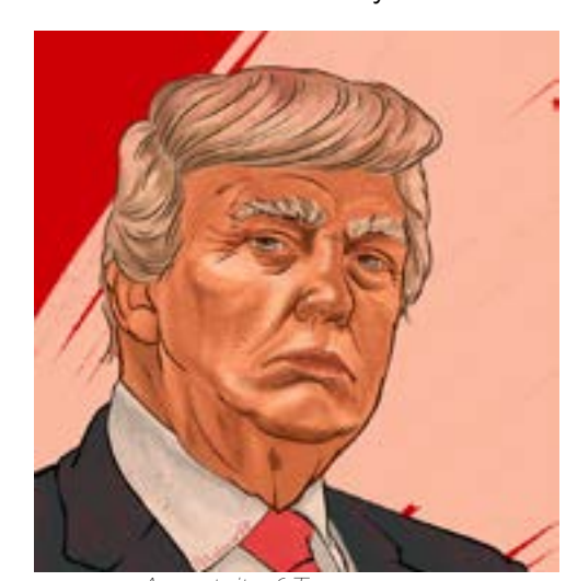
A portait of Trump.

mourn the death of Soleimani in Iran. It wasn't your typical funeral, and rather looked like Barack Obama's Inauguration speech in 2009 when almost the whole U.S. came. This Iranian general had so much love from his people and the evidence used to criminalise