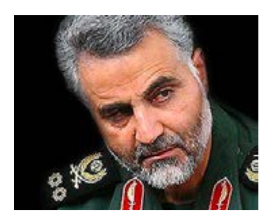
Soleimani posing for a picture.

Besides the fact that Iran voted to kick out US troops. They also made a vow to retaliate against the U.S. with the military as their weapon. If that doesn't have war written all over it, I don't know what does. During a protest/demonstration, Iranians were shown tearing up a U.S. flag. Iran also divorced the nuclear deal which was an agreement made in 2015. To summarize, World War III may just be in the making overall.